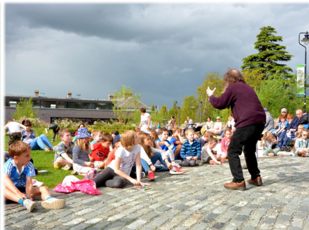
taken during Heritage Week including children listening enthralled to the Seanchaí. The Heritage Centre is a great asset for our Community and entry is free so please do call in and browse at your leisure.