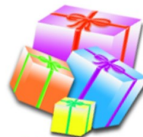
Four Gifts for you this Advent

The days are surely coming, says the LORD, when I will make a new covenant with the house of Israel and the house of Judah. It will not be like the covenant that I made with their ancestors when I took them by the hand to bring them out of the land of Egypt - a covenant that they broke, though I was their husband, says the LORD. But this is the covenant that I will make with the house of Israel after