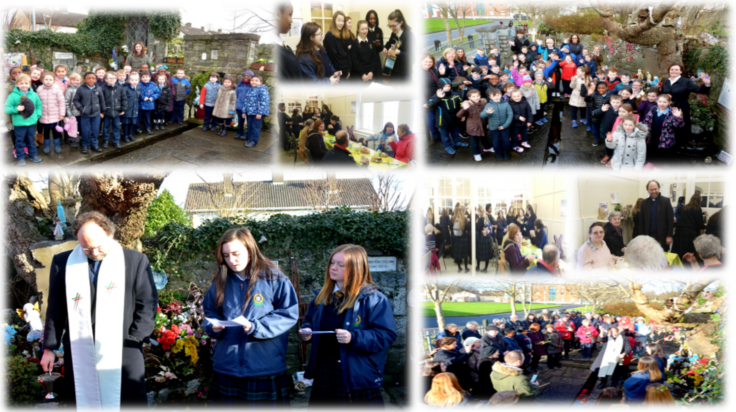
And St Brigid, our Mhuire na Gael, smiled fondly on all who visited the "WELL" on her Feast day. "Thank You" to all who keep the Well looking so beautifully and to all the teachers who took the school children to visit! And for the pupils who hosted the cuppa and provided the entertainment afterwards!!