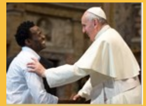
World Day of Migrants and Refugees

Christmas seems so far away now as life takes on some semblance of the routine and ordinary. But, today, as we celebrate the World Day of Migrants and Refugees we remember that for many, even within our own community, their reality is far from normal.