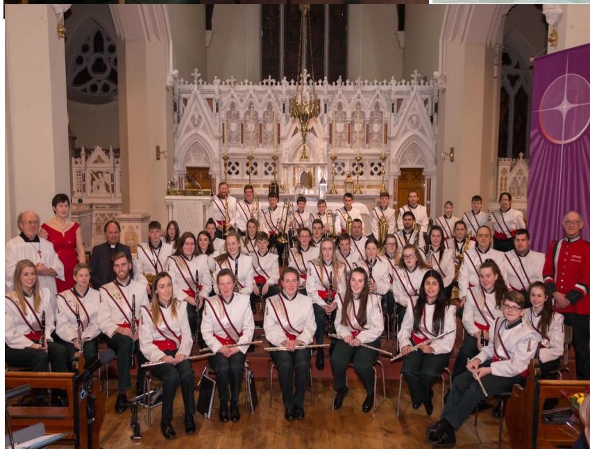
Clondalkin Youth band and guests at "The Carol Festival" in Clondalkin Church last Monday evening.

Outreach in Liffey Valley: A huge thanks to all the volunteers, clergy, staff and management of Liffey Valley Shopping Centre but mostly to you who visited, supported, availed of the opportunity, smiled or were amazed...for making our little outreach last Saturday "A Little Christmas Peace in the Valley" such a tremendous, memorable and moving experience for all involved! Thanks and all the blessings of the Season to you and yours! We in the Parish say "Well Done and we are proud of you!"