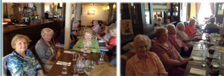
Members of the Monday Club enjoying their outing on the 18th July to Cobh. Due to lack of space the photos could not be included sooner!