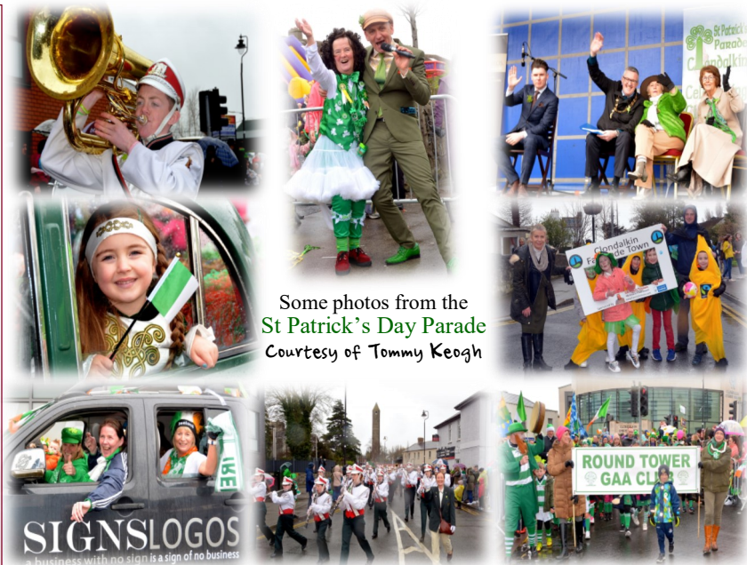
Some photos from the St Patrick's Day Parade

Monday Club 13 March 2017 - Today we had a traditional music session to get us in the mood for the celebration of St Patrick's Day .