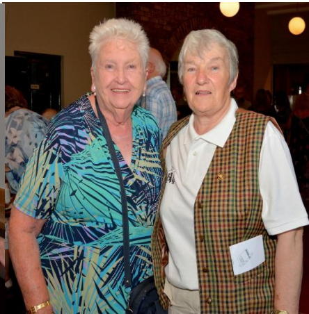
Attending the 40th Annual Mass for deceased members of the Round Tower's GAA Club recently.