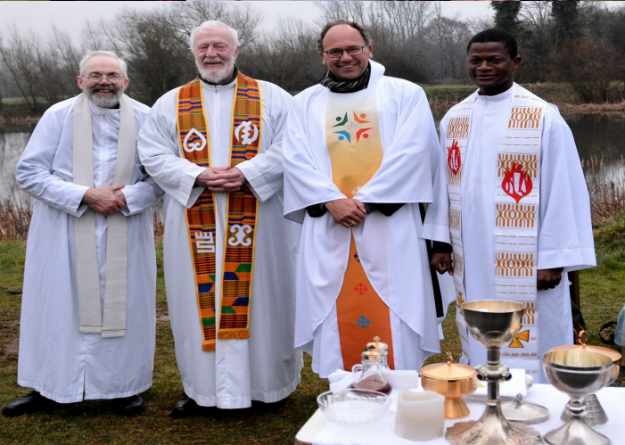
The hardy souls who braved the early morning dew and bitterly cold wind to celebrate the Easter Morning Dawn Mass, while many of us were just turning over for a second sleep. Tommy Keogh was there to capture the moment.