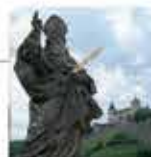
Statue of Saint Kilian (with the Fortress of Marienberg in the background)

Irish Franconian Apostle Born - 640 AD Died - 8 July 689 Venerated in the Roman Catholic & Eastern Orthodox Churches Feast Day - July 8th Attributes - Usually depicted wearing a bishop's mitre and wielding a sword Patron St of - sufferers of rheumatism!