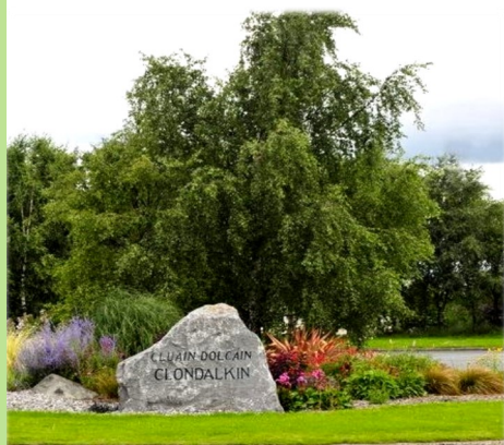
Entrance to our beautiful Village also last Spring.