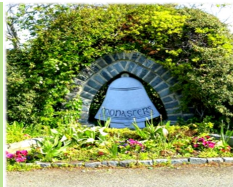
Entrance to Monastery Estate last Spring