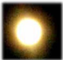
Photo sent in by Eddie. He tells us that it is called the worm super moon! As the worms are now burrowing up. Date is 21st. but visible today. The photo reminds of Dave Carnegie's quote "Two men looked out from prison bars. One saw mud, the other stars" Teresa

This Lent remember to do something each day to put a smile on someone's face!!