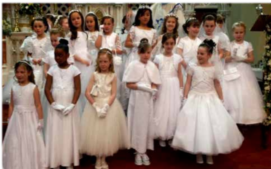
At the 12 noon Mass last Sunday - chosen by the parents as more suited for them and their children.

Eddie ensured that the Easter Garden reflected the joyful occasion!