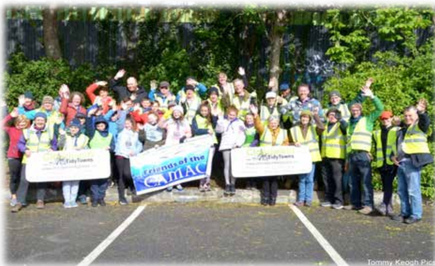
Photo of the two local Community groups who participated in the recent Annual 'An Taisce' Spring Clean Up day, Clondalkin Tidy Towns and Friends of the Camac, in a clean up of Clondalkin Park, and collected 18 bags of rubbish in total, in preparation for the approaching judging for the National Supervalue Tidy Towns Competition .

Volunteers are always welcome to join. Our meeting places are Saturday morning at 10.00am in Tuthills car park for the weekly Tidy Towns village cleanup while Friends of the Camac meet on the first Saturday of the month in the Leisure Centre Car park on Old Nangor Rd. also at 10.00am