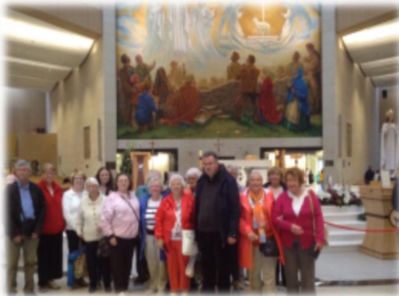
Some of the pilgrims who took part in the Annual Pilgrimage to Knock on Saturday 7th September in glorious sunshine. is taken after the 3pm Mass and just before leaving Knock to start the journey home. The mural depicts the scene of the Apparition in 1879 and the colours are truly stunning.