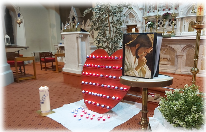
For all our loved ones who died too soon - Thanks to all who took part in and organised our service on Thursday last.

See www.internationalmensday.com for more information