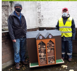
Clondalkin Mens Shed enjoying their weekly 'Socially distanced walk' along the Camac river in Corkagh Park. And congrats as their bug hotel finds a new home in the city - a 5 star bug hotel !