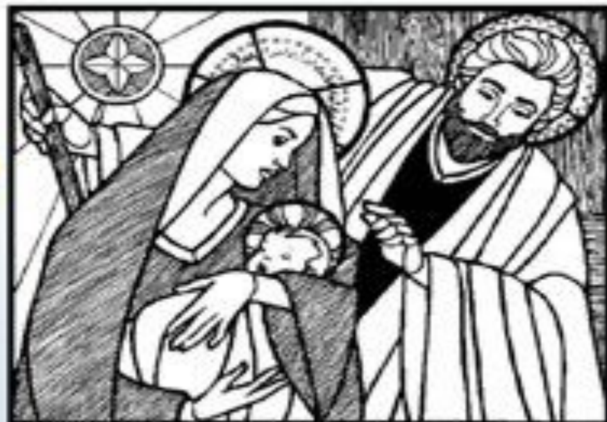
The Holy Family