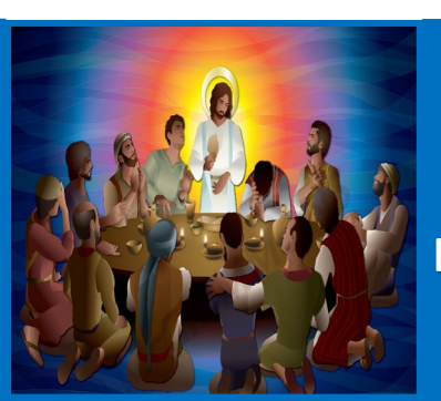
Lesson 1 First Reconciliation