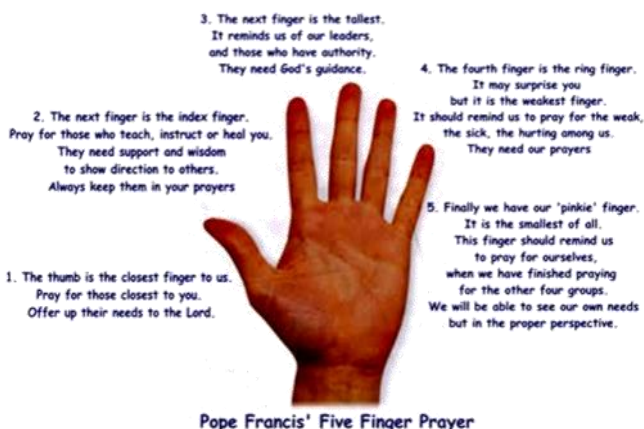
Pope Francis' Five Finger Prayer

And... say a prayer for someone you love, who loves you or who needs a prayer!