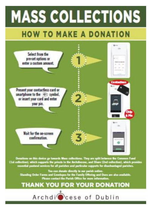
Thank you for your donation

Please use the simple step by step guide on the poster to donate.