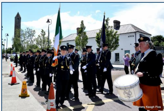
The Garda parade on Tower Road

The Centenary celebrations of 100 years of the Clondalkin Garda Station took place on Saturday 25 th June with a very impressive Garda parade around the Village, led by the Air Corps Pipe Band. The parade was followed by an Open Day at the Garda Station where members of the public, adults and children alike, mingled with the Gardai and the various equipment, Equestrian Group, Lifeboat, Traffic Controllers etc, etc. Tours of the station office and cells were conducted throughout the afternoon also. Presentations were made to the winners of the Children's Art Competition and the Clondalkin Youth Band provided musical enjoyment for everybody.